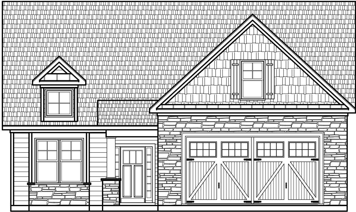
FRONT ELEVATION 'A'