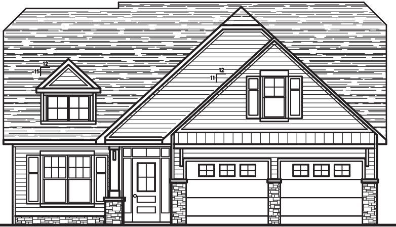
3 FRONT ELEVATION A101 | SCALE: 3/32"=1'-0"