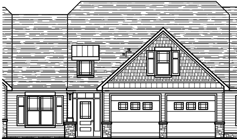
3 FRONT ELEVATION