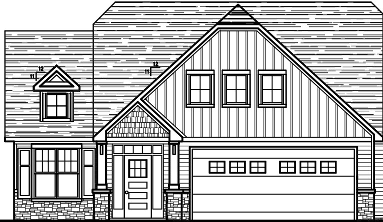
3 FRONT ELEVATION