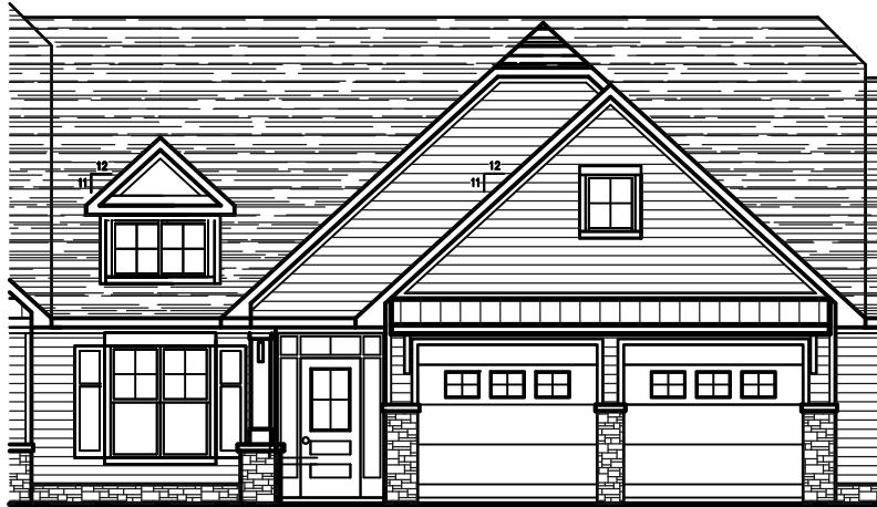
3 FRONT ELEVATION